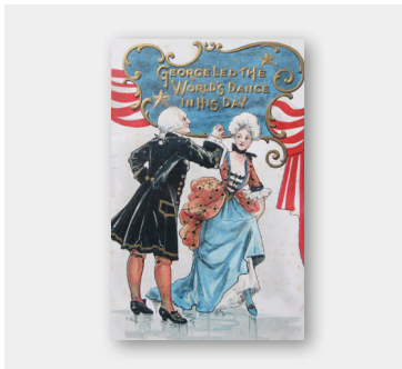
Couldn't resist this Ebay vintage postcard. 'George Led the World's Dance in His Day'. A true Virginian, he could dance three hours without pause