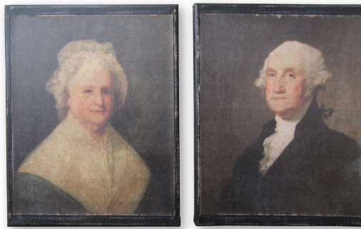
I loved looking at these dour Puritan images of the Washingtons. They made me determined to breathe life into George and Martha in my book