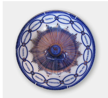
Poor imitation - but my own - of 'States china'. Manufactured in Canton as a present for Martha. Complete with 'MW' initials central