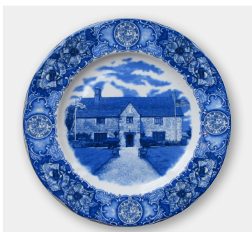
Sumptuous plate showing Sulgrave Manor. Washington's ancestral home near Banbury, UK. Gift of Colonial Dames of New York