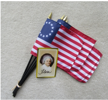
Table decoration souvenirs from my New York publication dinner. All good friends and many of them fellow authors