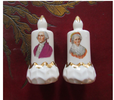
George and Martha salt and pepper souvenirs from Valley Forge. Delightful publication present from friends at the Library of Congress