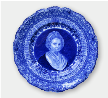
Martha Washington souvenir plate. A reminder of the many dinner services that she and George commissioned for Mount Vernon