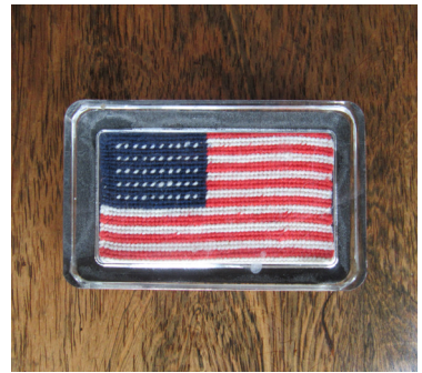
Patriotic paperweight that I cherish. Given me by a good American friend in London