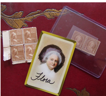
Martha Washington 4-cent and 11/2-cent stamps of different eras. And a 21st century place card