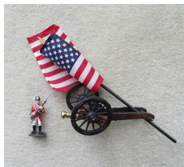
Produce of various US National Park Service revolutionary war sites. nps.gov, I love your shops!