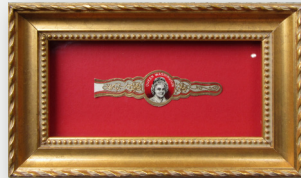
Vintage 'Queen Washington' cigar band, beautifully framed. Publication present from a dear friend