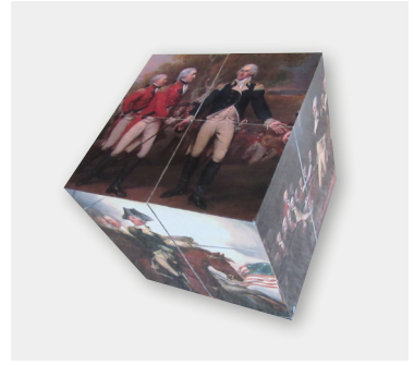
Washington puzzle box. On my desk while I wrote the war chapters of my book. Inspiration and diversion