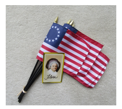
Table decoration souvenirs from my New York publication dinner. All good friends and many of them fellow authors