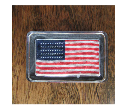
Patriotic paperweight that I cherish. Given me by a good American friend in London