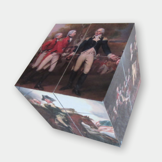
Washington puzzle box. On my desk while I wrote the war chapters of my book. Inspiration and diversion