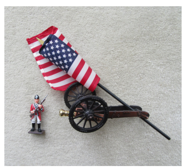
Produce of various US National Park Service revolutionary war sites. nps.gov, I love your shops!