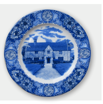
Sumptuous plate showing Sulgrave Manor. Washington's ancestral home near Banbury, UK. Gift of Colonial Dames of New York