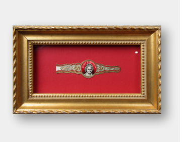
Vintage 'Queen Washington' cigar band, beautifully framed. Publication present from a dear friend