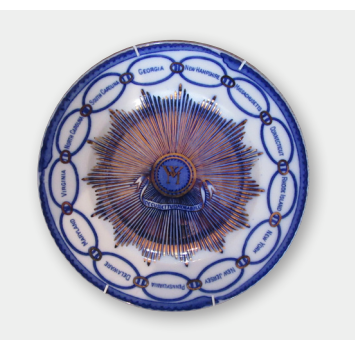
Poor imitation - but my own - of 'States china'. Manufactured in Canton as a present for Martha. Complete with 'MW' initials central